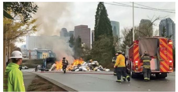
A lithium-ion battery sparked this waste truck fire that closed a city street and put surrounding properties at risk in Bellevue, Washington.

and similar items, from other waste. Set aside old electronic devices, such as computers, televisions, laptops, tablets, smartphones and wireless speakers.